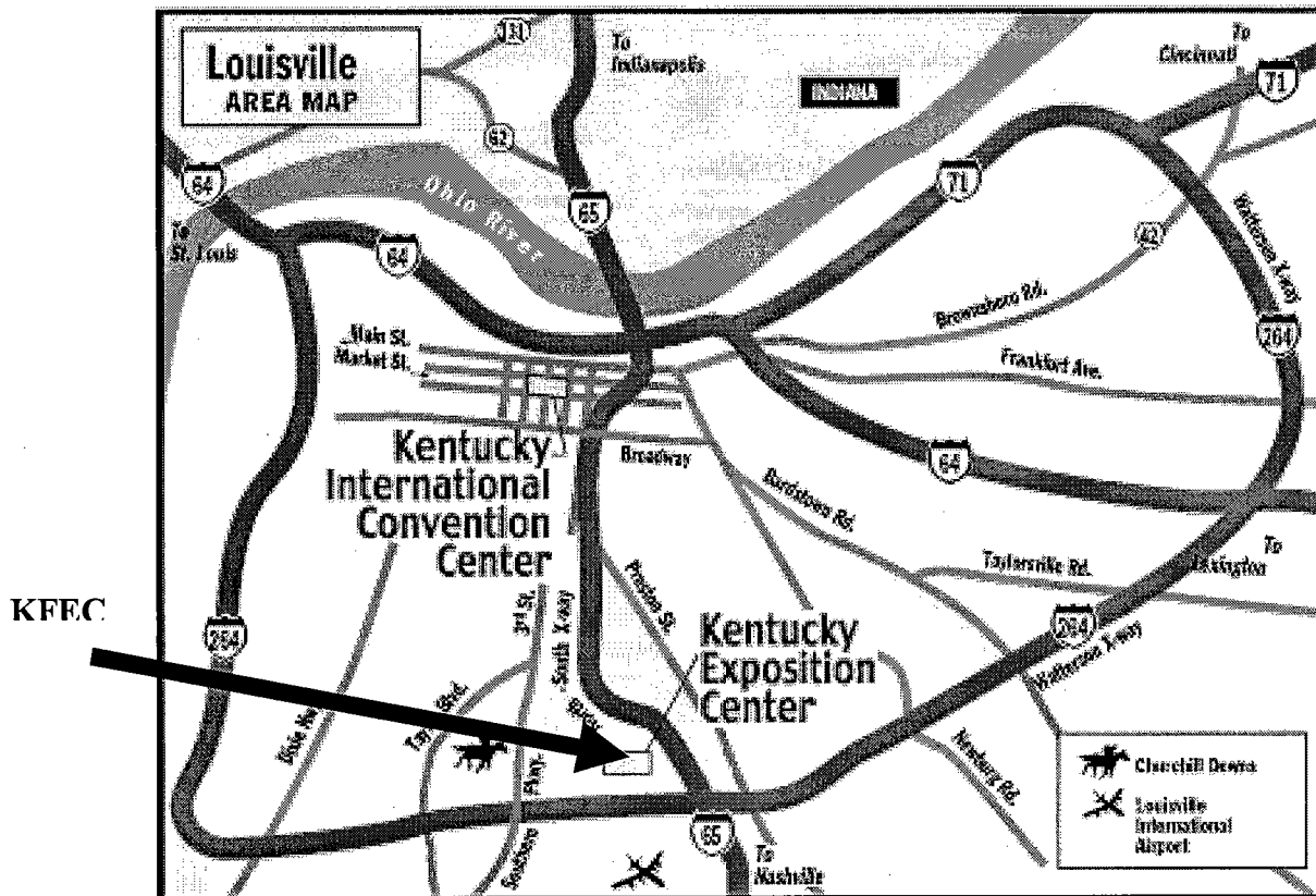
I-264 and I-65 Interchange, near Louisville International Airport

This show will recognize both youth and amateur high point individuals. Show results will also be sent to national youth and amateur committees for award recognition.